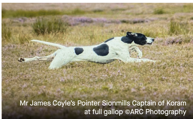
Mr James Coyle's Pointer Sionmills Captain of Koram at full gallop

As set out in the Royal Kennel Club regulations for Pointers and Setters, the basic requirements are as follows: "Dogs shall be required to quarter ground systematically with pace and style in search of gamebirds, to point gamebirds, to be steady to flush and shot and, where applicable, to fall. Dogs should not be gun shy. The dog should work its point out freely, on command without the handler either touching the dog or moving in front of it". Sounds easy, but in practice can be very difficult.