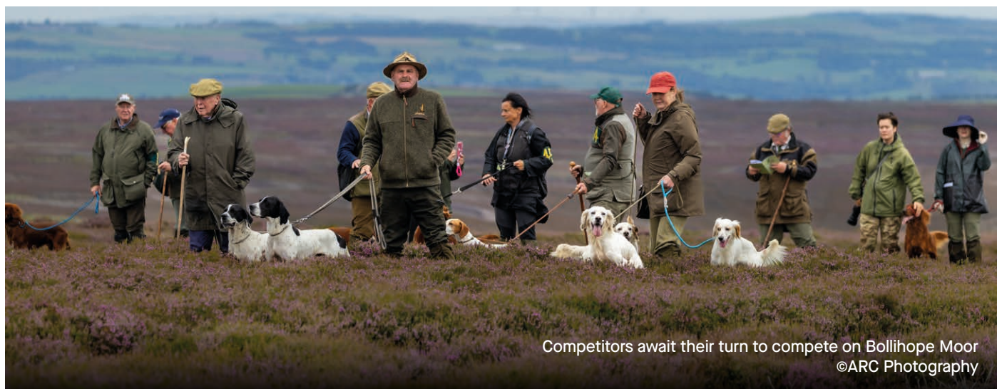
Competitors await their turn to compete on Bollihope Moor