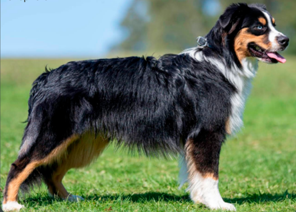
Miniature American Shepherd

The Miniature American Shepherd will be recognised by the Royal Kennel Club with effect from 1 July 2026.