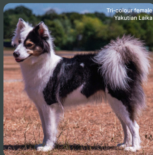
Tri-colour female Yakutian Laika

The Royal Kennel Club will recognise 227 breeds of pedigree dog from 1 July 2026 following the simultaneous recognition of the Miniature American Shepherd. The last breed to be recognised was the Hungarian Mudi in July 2025.