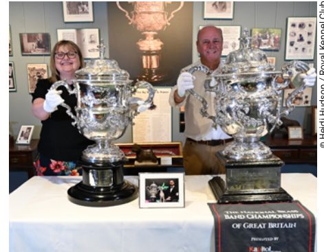
The Keddell Memorial Trophy meets the National Challenge Trophy

Our breeds of the month are the charming German Spitz (Klein) and (Mittel), that share the same breed standard, divided only by size. Discover the foundation and history of these Spitz breeds. We invite seven judges to choose their three favourite German Spitz (Kleins) and (Mittels) that they have judged in the show ring in the