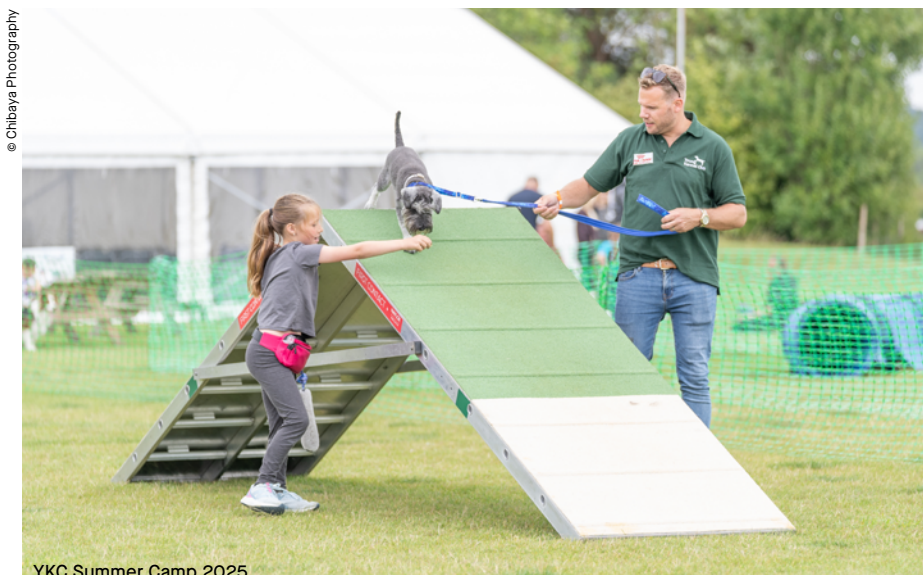
YKC Summer Camp 2025