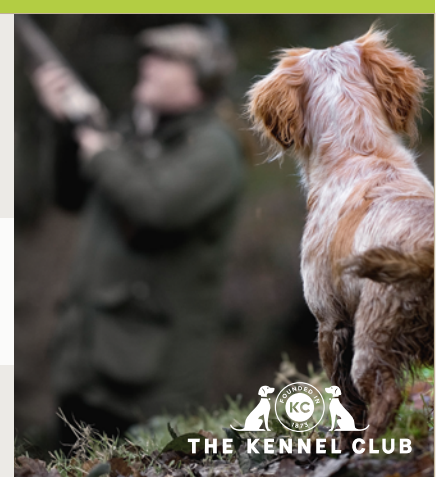
THE KENNEL CLUB

Book your training activities with the Emblehope Estate: thekennelclub.org.uk/emblehope | emblehope@thekennelclub.org.uk 01296 318540 ext 290